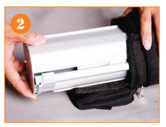
2. Take out the base from the bag.