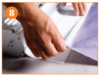
8. Attach the base of the graphic on top of the adhesive and press firmly to secure.