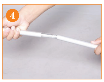
4. Connect the 4 section pole.