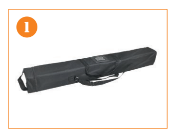
1. Black padded bag.