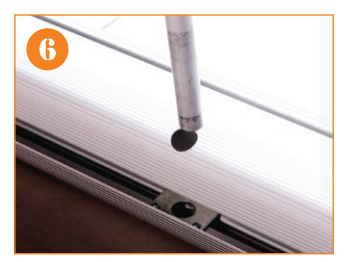
6. Insert the pole into the base.