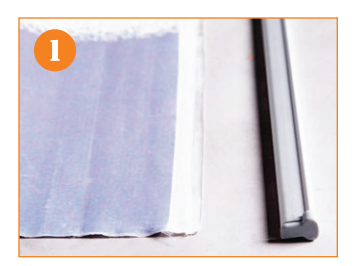
1. Arrange the graphic and the top bar so they are parallel to each other.