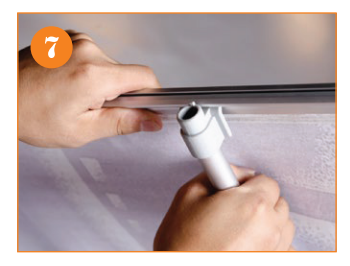
7. Attach the top bar on the top clamp profile.