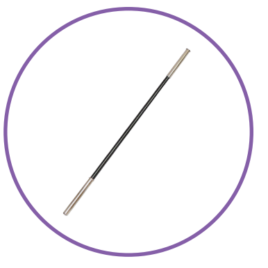
QTY 1: Pole 1b

• 45 1/2" H • 5/16" Diameter (Bottom Pole)