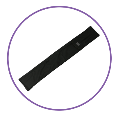
QTY 1: Carry Bag

Outside Dimensions: • 47" L × 7" W Inside Dimensions: • 47" L x 15" W